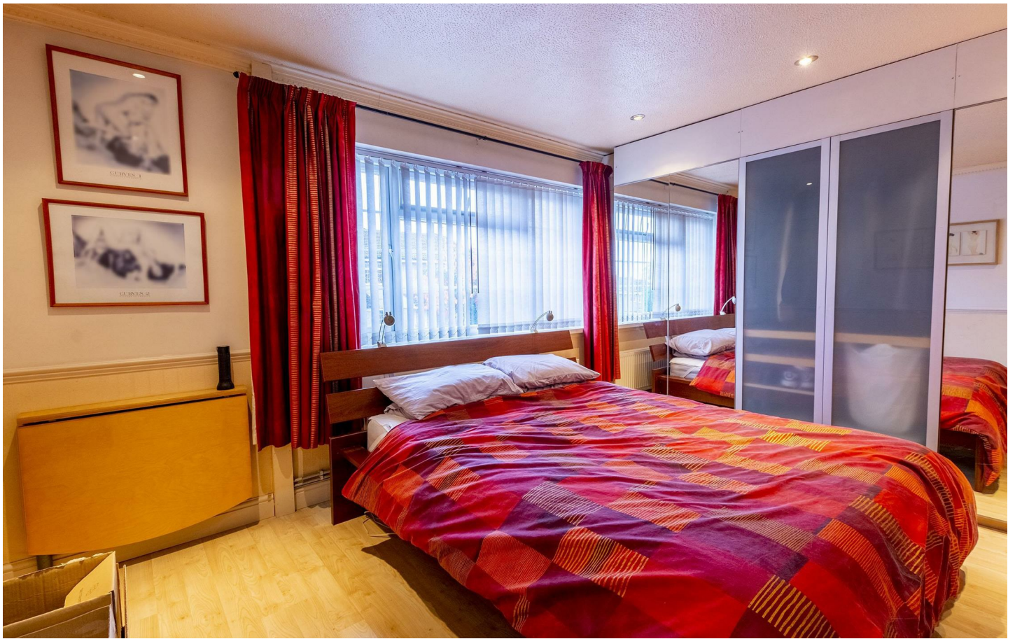
A ONE DOUBLE BEDROOM MAISONETTE BEING SOLD WITH THE BENEFIT OF NO UPWARD CHAIN.

Robert Ellis are delighted to bring to the market a one bedroom property which would ideally suit the cash buyer. Situated within a cul-de-sac location in the popular residential area of Sandiacre, close to local amenities and transport links that the area has to offer. The property does currently have a shower room, but does need finishing by having the plastering and tiling to be done. Due to the length left of the lease this purchase is only suitable for cash buyers, further information on request. An early internal viewing is highly recommended to fully appreciate the accommodation on offer.